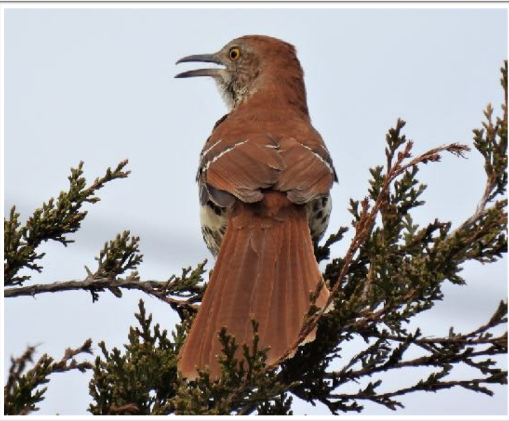
Brown Thrasher, Nemasket Trail, Carver, May 2021