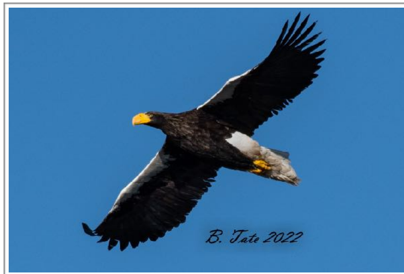
Flyby towards the mouth of the Pemaquid River and the sea, Maine, January, 2022