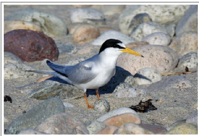
Least Tern, Plymouth Long Beach, May 2018

*This trip is co-sponsored with the Brookline Bird Club.