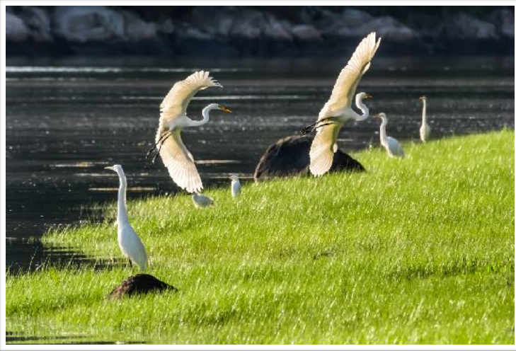
Great Egrets, Snowy Egrets, World's End, June, 2018

*This trip is co-sponsored with the Brookline Bird Club.