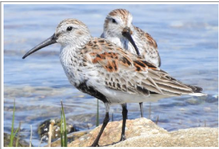
Dunlin, Winsegansett Marsh, Fairhaven, May 2021

*This trip is co-sponsored with the Brookline Bird Club.