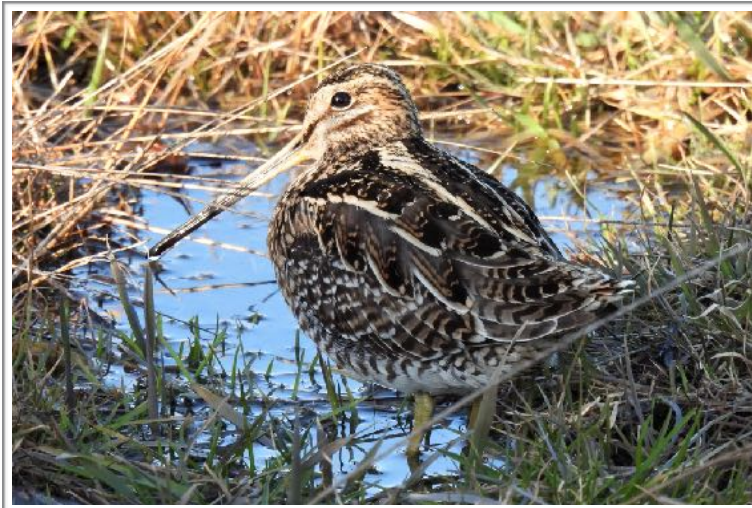
Wilson's Snipe, Shaws Cove Road, Fairhaven March 2021

Looking for migrants along the Billings Farm Loop. Nice place to work on your "birding by ear" skills. Let's find what Glenn can hear!