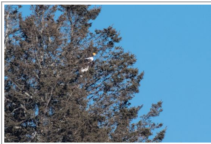
Steller's Sea Eagle at the mouth of the Pemaquid River, Maine, January, 2022