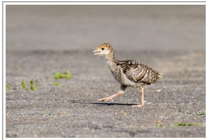
Wild Turkey poult, Hull, June 2020

Wollomonopoag Conservation Area is an area of mixed hardwoods, pines, and swamps near Lake Pearl. We'll explore the area and spend some time viewing a large Great Blue Heron rookery where herons nest in a flooded area with tall, scattered leafless trees. Typically in the spring, the heron count can be well into the double digits with the possibility of an osprey nest in the mix.