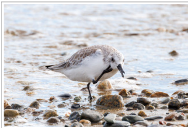
Sanderling, Gooseberry Neck, December, 2021

http://southshorebirdclubma.blogspot.com/