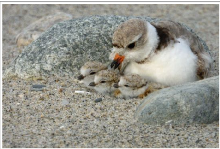
Piping Plovers, Plymouth Long Beach, June 2020

As we all know well by now this situation is fluid. SSBC will continue to monitor COVID public health recommendations and will update this guidance as necessary. Thanks for helping to keep us healthy while birding together!